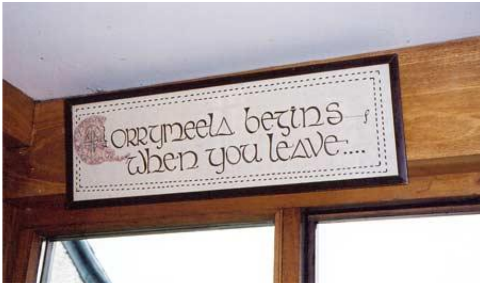
Figure 2: Sign above the main entrance to the Main House at the Ballycastle Centre

Corrymeela is explicit about its intention to extend its culture and ideas beyond the Community. A sign above the exit in the Main House at the Ballycastle Centre states “Corrymeela begins when you leave” (see Figure 2 below).