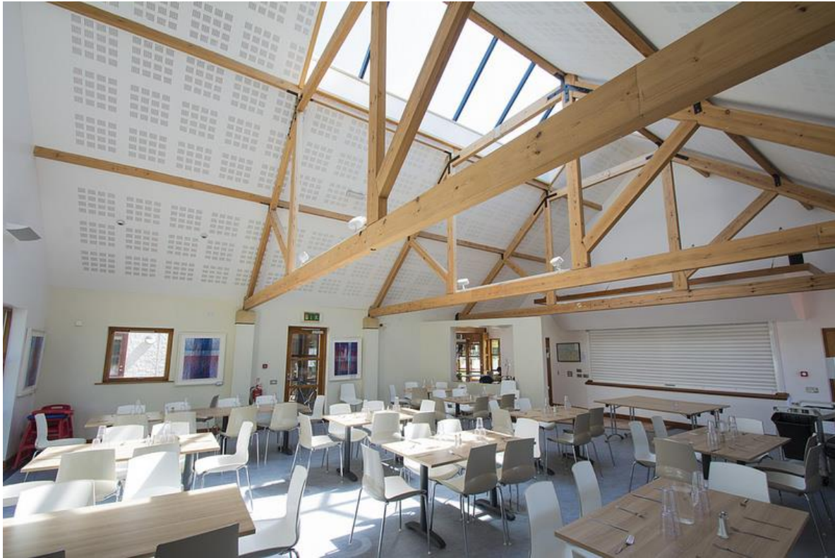
Figure 1: The dining hall at Corrymeela's Ballycastle Centre

The dining hall is set up in tables of six, and there is an unofficial policy encouraging staff and volunteers to sit with different groups as a means of promoting interactions (Personal Observations 2009, 2017, 2018; Martin 2017). There were various examples of bridging capital being initiated by inter-group mixing during mealtimes. I established many relationships from sitting with strangers and getting to know them over a meal. In one instance, I made connections with a visiting Rabbi from Israel, resulting in a free lift to Dublin and an invite to visit his peace centre if I was ever in Jerusalem. This type of interaction was commonplace. Martha Martin encouraged her participants to mix with people they didn't know and observed that a number of them blended well with the other groups present onsite (Martin 2017). On the power of this tradition, she stated: