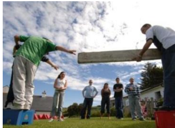
Figure 2: A group participate in ‘Bridging the Gap’, an activity that requires teamwork and communication to allow participants to traverse an area without touching the ground.