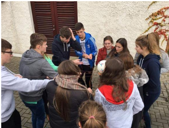
Figure 1: A group of young people participate in ‘Raising the Sun’, an activity that requires teamwork and communication to carry a ball upon a hoop that is lifted by an individual thread controlled by each participant.

Following the initial group-building sessions at Corrymeela, other activities, such as Four Corners (where posters stating ‘strongly agree’, ‘agree’, ‘strongly disagree’ and ‘disagree’ are posted on each of the four corners of a room and individuals express their opinion on a chosen topic by choosing where to stand) were used to open up discussions more directly. These sessions have remained largely unchanged since at least the early-1990s (Correspondence with former volunteer, Tim Wilson 07/07/19).